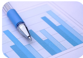
PUBLISHING & DATA ANALYTIC