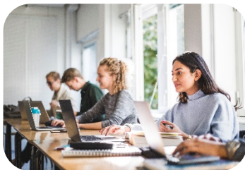
TRAINING, COACHING, & CERTIFICATION